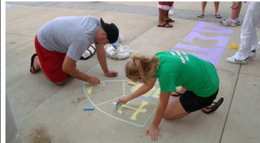
Student work hard on their 08' Chalk-N-Rock

Look for next edition of "The Club" to arrive in your email inbox on October 1