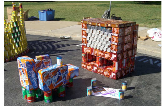
Homecoming Philanthropy event: CanStruction

Final application deadline for all competitions